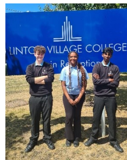
LVC Junior Leadership Team

The newly appointed Junior Leadership Team at Linton Village College are passionate about making a meaningful impact. From enhancing student wellbeing and communication to improving facilities and celebrating creativity,